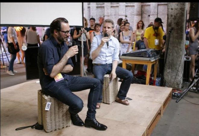
Mikser house Belgrade, creative industries