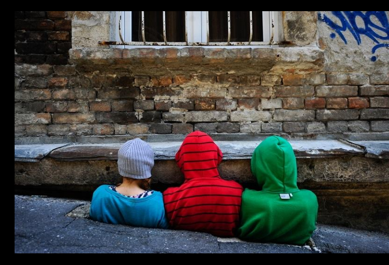
Mikser Festival Belgrade / Peformence